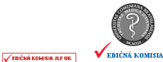
Figure 2. Logos indicating the educational works, which are recognized by Editorial Commission of JLF UK

Educational works that are recognized by Editorial Commission of JLF UK, are on the Portal identified by the logo shown below (see Figure 2).